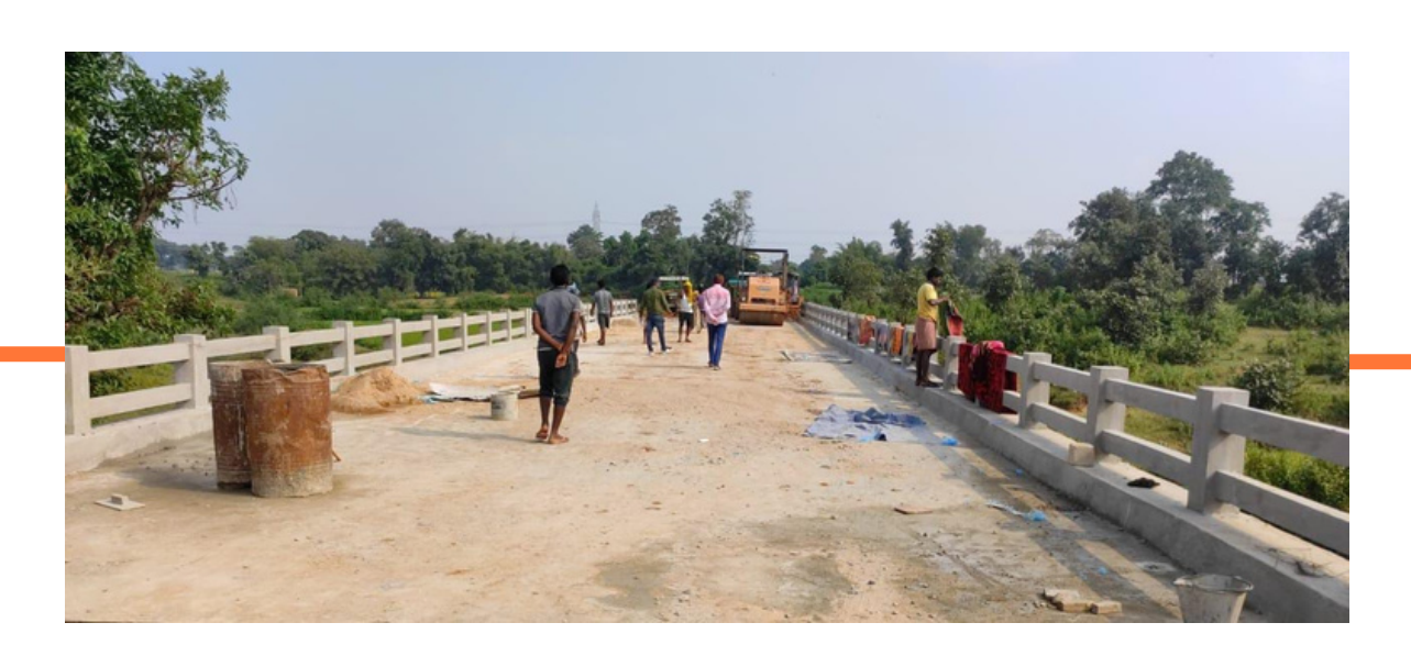
Construction of the bridge through the DMFT fund

Ramgarh lies at the heart of Jharkhand state. The Swaniti team at Ramgarh identified that the two villages Sosokala and Kumhardaga situated at a distance of 3 km were poorly connected. The people experienced difficulties as the distance doubled to 7 km due to a lack of roads and connectivity. A make-shift bamboo bridge was constructed but it posed a security risk, especially during the time of emergency. There were several challenges that the villagers faced including delays in health emergencies, impact on institutional deliveries, and a lack of market supply chain for the farmers. Through the District Mineral Foundation Trust, the District Administration built the bridge connecting the communities. The bridge's construction has not only increased student attendance rates and the prompt supply of health services to Kumhardaga residents, but it has also proven beneficial for the farmers' livelihoods.